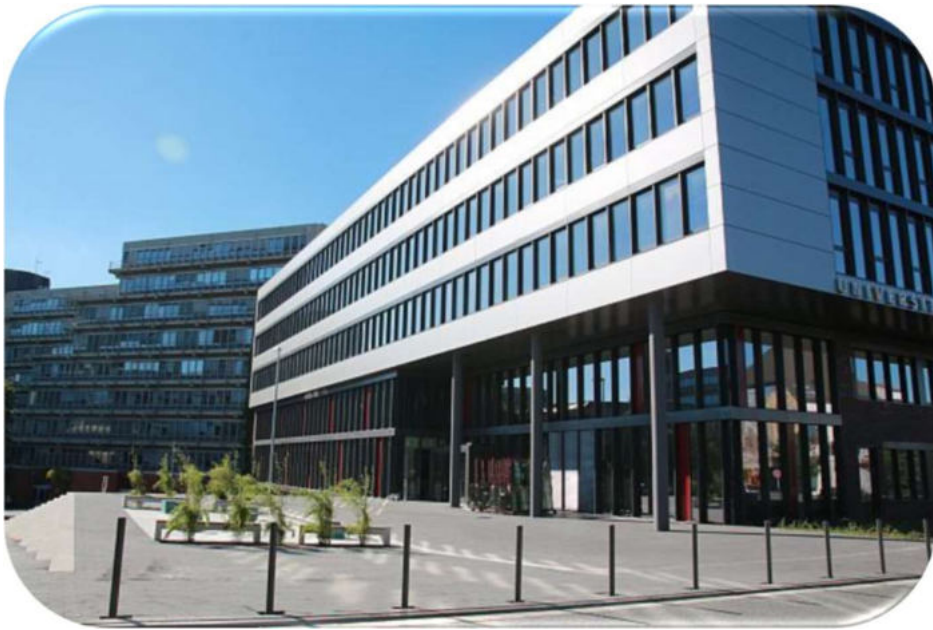
Q-Building, 27.09.2013