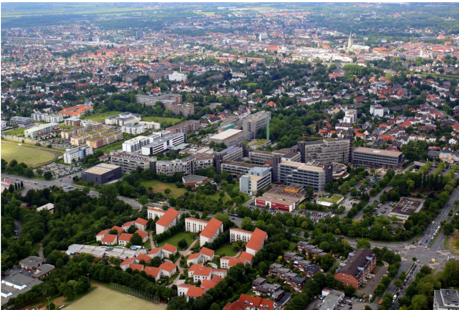
(University of Paderborn, 14.06.2013)